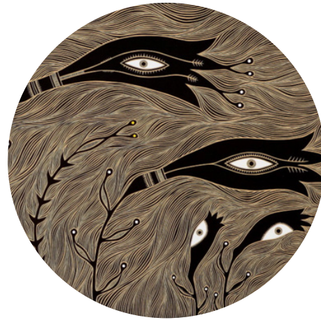
Etan Pavavalung The wind blows between heaven and earth 2021