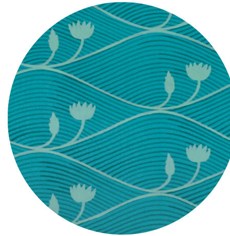
Than Sok Kbach Teuk (Lotus Flower Form) 2021