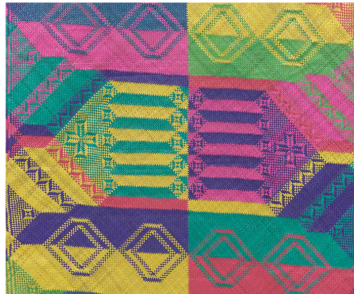
Norbaya Summalani Harunan Motol (Tangga Perahu) (Boat Ladder) 2019

Wave patterns, diamonds, and ladder motifs all represent aspects of their lives by the sea.