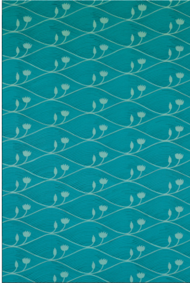
Than Sok Kbach Teuk (Lotus Flower Form) 2021

Than Sok's series is based on the depiction of water patterns in Buddhist temple mural painting. Each work is a study of a particular plant or animal – such as lotus flowers, shrimp, or fish – transformed into a unique water design.